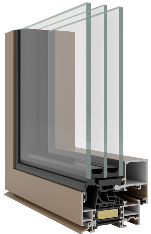
Photo: Example application of the system.